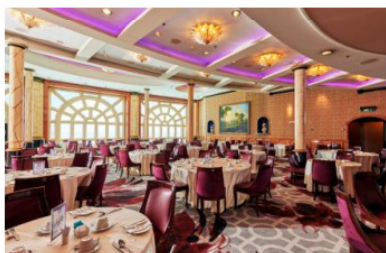
Dream Dining Room

總噸位 75,338 噸 載客 Guests 1,856 人 甲板 Decks 13 層