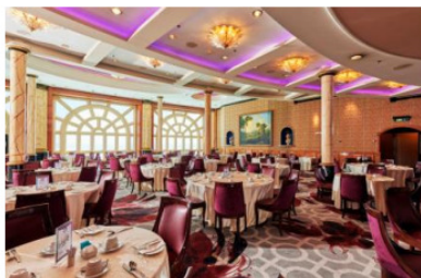
Dream Dining Room

總噸位 75,338 噸 載客 Guests 1,856 人 甲板 Decks 13 層